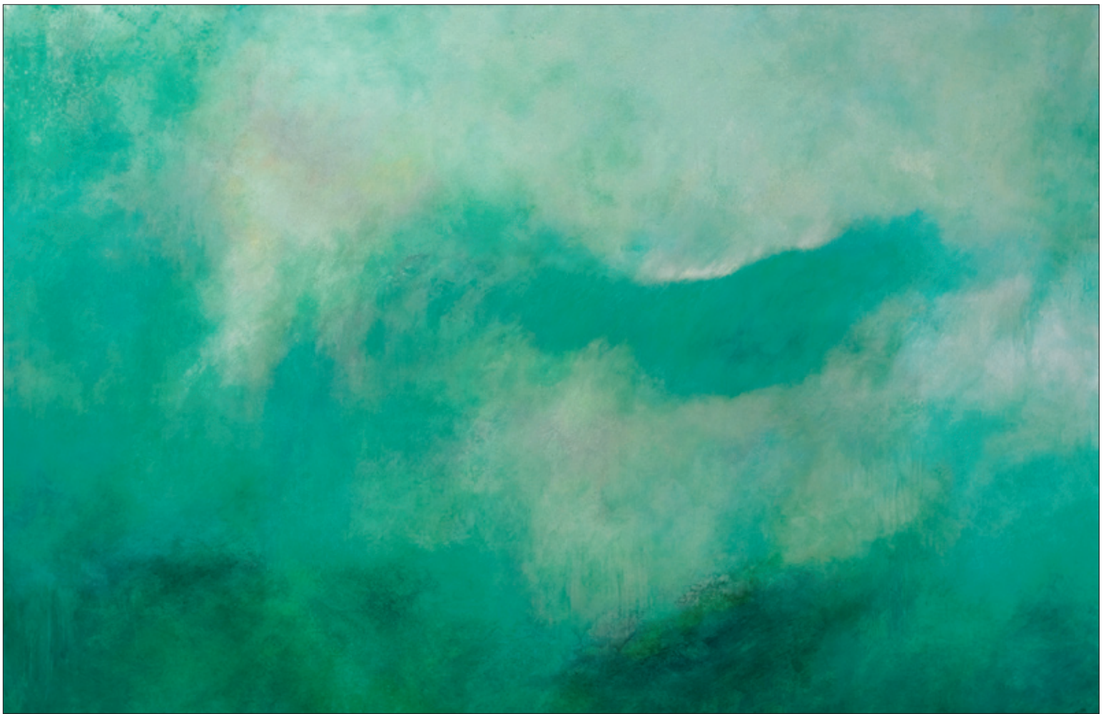
Above: "Symphony at Sea," 48" x 72"; and "Serenity," 60" x 48"