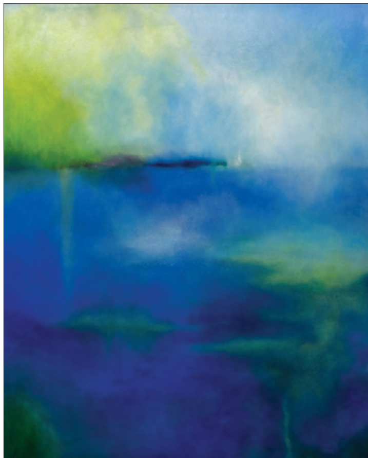
Opposite: "Served Moment II," 36" x 36" All are oil on canvas

you're going to go because the whole idea is to share with you a passage so that you can take your own personal journey... and you kind of lose yourself. You daydream your way into a painting; you go for miles and miles, and you just decide where you're going."